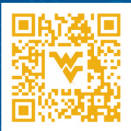
Scan to get started!

Visit go.wvu.edu/selfguidedtour to get started with our self-guided tour.