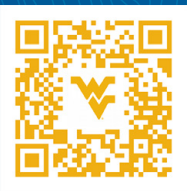
Let us know you were here!